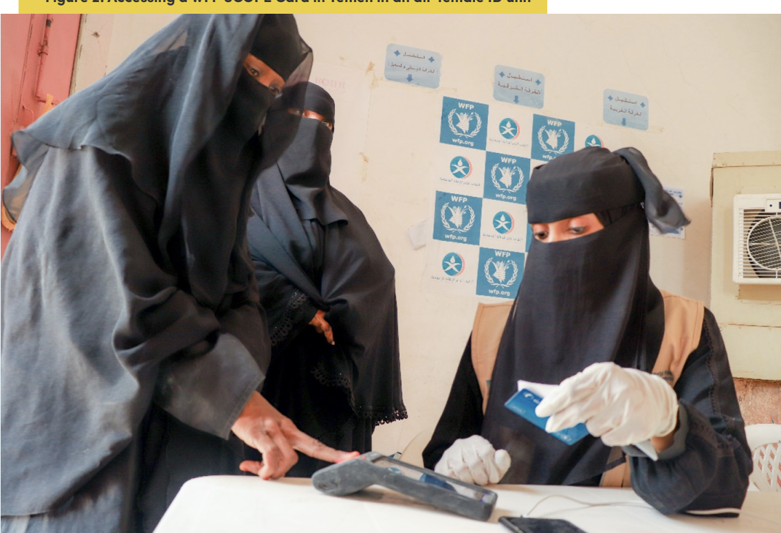
Figure 2: Accessing a WFP SCOPE Card in Yemen in an all-female ID unit

In Afghanistan, WFP offers recipients several choices to receive their transfer, including direct cash payments, commodity vouchers and pre-paid cards from Azzizi Bank. This allows cash transfer recipients, even those with IDs and registered SIM cards, to choose the method that corresponds best to their needs.